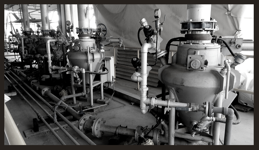
This leaflet is intended for guidance only. It does not form part of any contract and is subject to change without notice